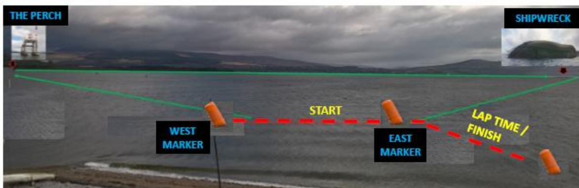
Course viewed from the RWSABC Beach